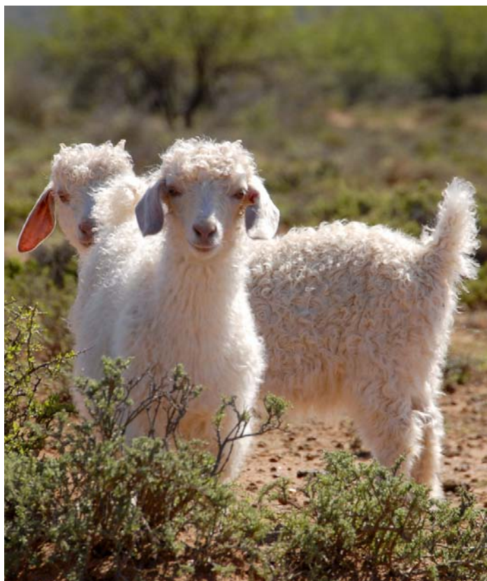
The Angora goats do not eat the herbs and can therefore graze on the cultivated area.