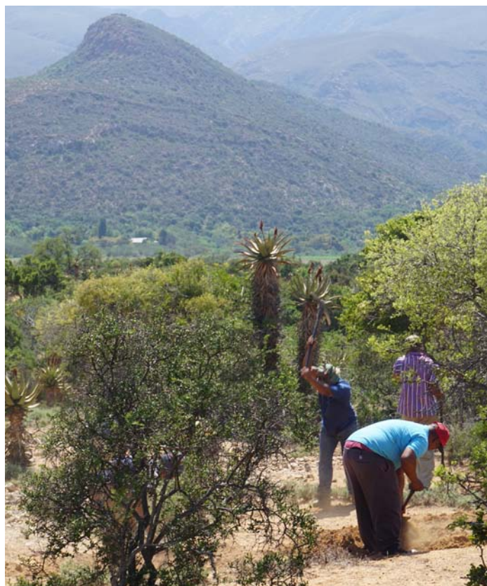
Community members are hired for digging water retention ponds.