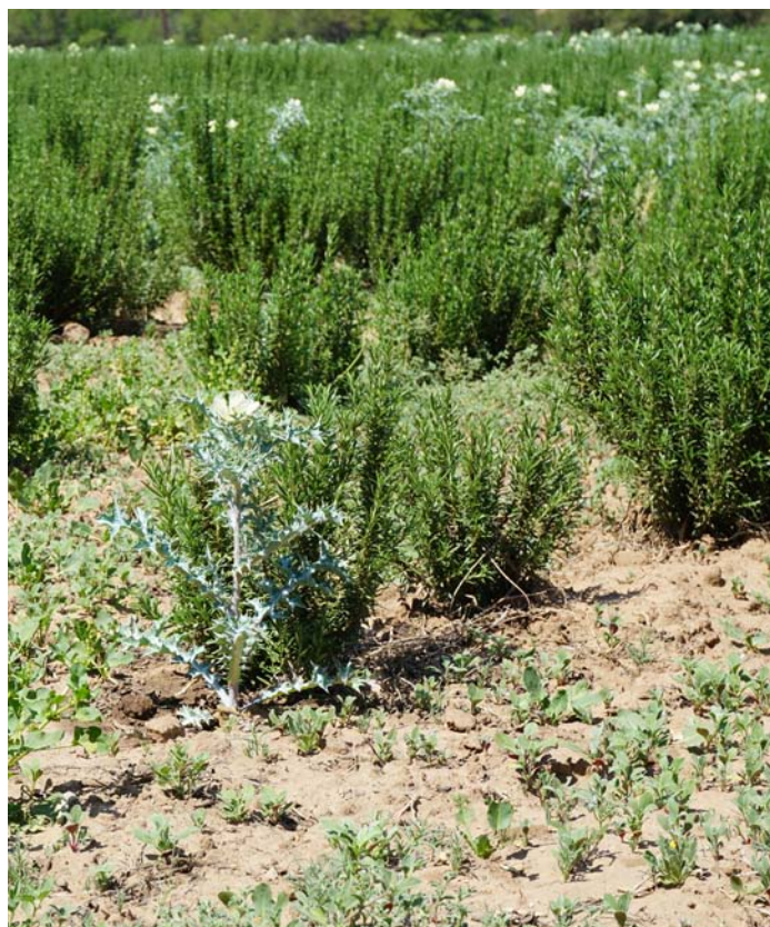
Rosemary cultivation is one of the building blocks of sustainable land management.