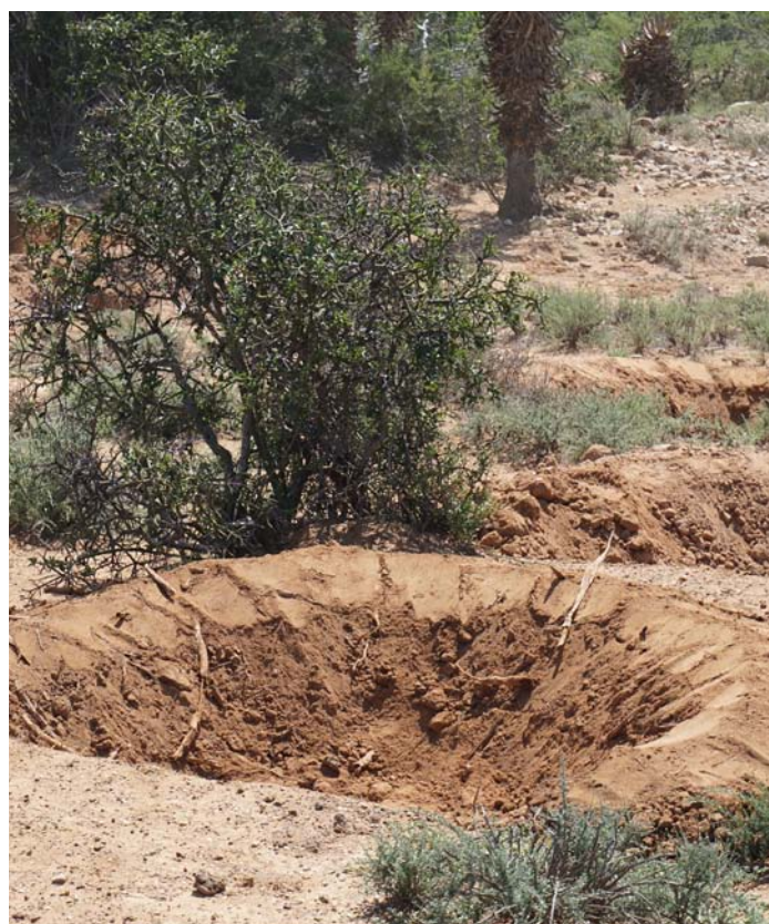
Semicircular water retention holes to reduce water runoff. These are dug by hand.

Regenerative agriculture is a completely new concept for DevCo farmers. The aim of the concept is to use the agricultural land economically while improving and maintaining soil quality and biological diversity. The measures in the Baviaanskloof valley on the farmers' land have been adapted to the soil conditions and needs of the respective farmers. Currently, only the four farmers of the Baviaanskloof Development Company (DevCo) are implementing regenerative agriculture practices. In cooperation with the DevCo General Manager, each farmer develops a management plan for his farm. This plan includes catch crops and fodder crops between the main crops for the diversification of the fields. In addition, all farmers have their own nurseries and produce compost that is enriched with nutrients and biochar to be used as a biological fertilizer. The cultivation of fodder crops ensures the feeding of the goats and enables the farmers to keep areas on the slopes for rehabilitation free from livestock. In addition, DevCo farmers have reduced the number of goats, thus reducing the risk of overgrazing. An agreement between the farmers and Commonland stipulates that the number of animals will be reduced by one goat each if more than 30,000 Rand (approx. EUR 1,950) per hectare is earned from the cultivation of lavender and rosemary.