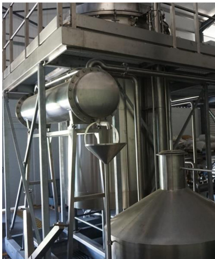
Essential oils are extracted from rosemary and lavandin in the distillation facility.