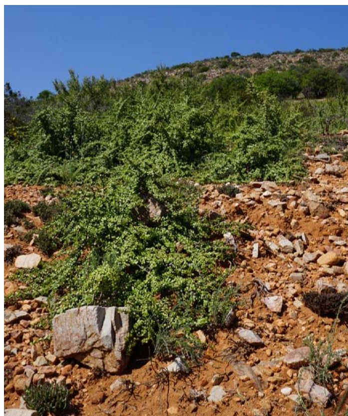
Planting the native Speckboom tree on the mountain slopes improves soil quality and protects against erosion.