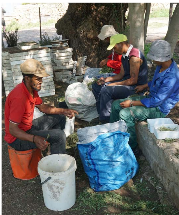
The workers prepare the rosemary cuttings for cultivation.

Commonland's four>Returns Framework is designed for large landscapes and is therefore basically scalable. However, experience with the Baviaanskloof has shown that new measures should first be tested on a small area before being implemented on a large scale. It is therefore advisable to start with pilot actions or to involve a local partner who has already gained experience with similar measures before implementing a large-scale project.