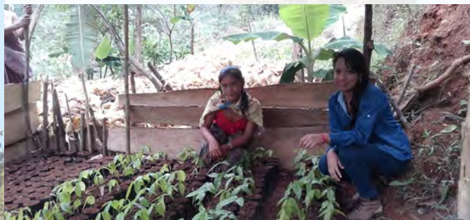
Seedlings for agroforestry systems are grown in nurseries within the communities.

In the Sierra del Lacandón , the status quo of existing agroforestry systems was investigated and problems caused by climatic impacts and partly insufficient management could be identified. In some parts, it was necessary to replace dead tree seedlings by new ones, which were provided by the project. In the future, the seedlings should primarily be sourced from the newly established local nursery gardens in the communities and families.