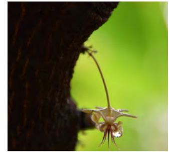
Cocoa is especially suitable for agroforestry systems. Currently, possibilities for the commercialisation are being examined.