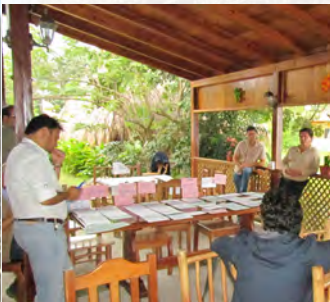
The first coordination workshops take place.

A special training for project staff and other employees