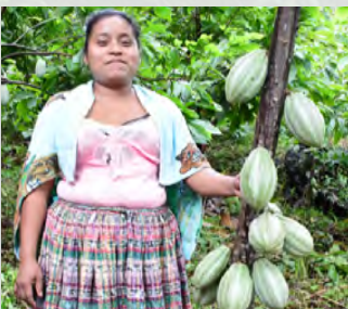
Creating sustainable value chains to expand forest conservation and developing innovative financing models at the same time - on-site in Guatemala and in Germany.

Within the project “ForestValues”, OroVerde and its partners count on creative and highly innovative minds who want to make a difference: New innovative financing models for forest landscape restoration with i.a. the construction of value chains have to be developed, realised and brought to life. Because of longstanding experience derived from on-site projects and varied networks, the three project partners offer the expertise on how the project can be implemented in local communities. The initiatives are developed, discussed and realised together with the local population. Products for cultivation or production, processing and commercialization can be cocoa, honey and breadnut. The latter is still quite unknown worldwide but has a lot of positive characteristics. It is, for example, gluten-free and many different products can be made from it, some of which are already sold on local and national markets. These investment options shall be used to promote forest conservation and restoration.