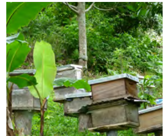
Diverse agroforestry systems provide a sustainable and ecological alternative to monocultures. Along with measures for reforestation, forest restoration in the communities can be promoted this way.

A guideline for public institutions, potential investors and NGOs shall be elaborated which is to serve as an indicator for the development of a business plan for the promotion of forest landscape restoration. This internationally valid guideline shows in which regards the business approach has to be examined to ensure sustainability and social compatibility.