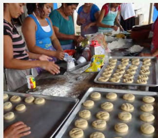
After being harvested, the Ramón seeds (left) are dried and ground. The flour is used to prepare different products such as biscuits (right).