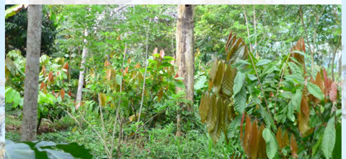
Besides cocoa many more plants contributing to food security can be cultivated in the agroforestry systems.

Based on this and additional studies, pilot projects within the "ForestValues" initiative can be planned and realised.