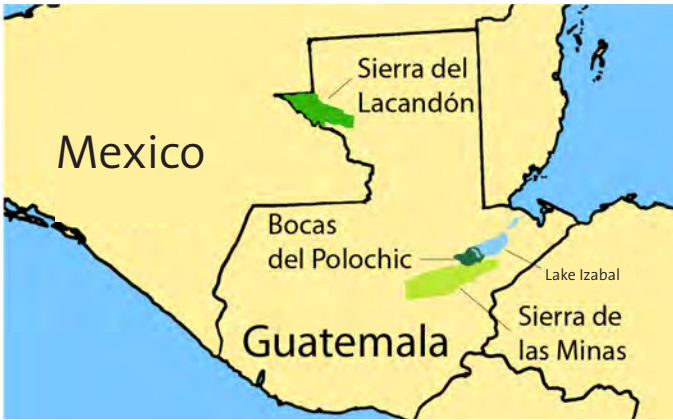
All three project regions, the Sierra del Lacandón National Park, the Biosphere Reserve Sierra de las Minas and the Wildlife Refuge Bocas del Polochic, are protected areas with a high biodiversity.