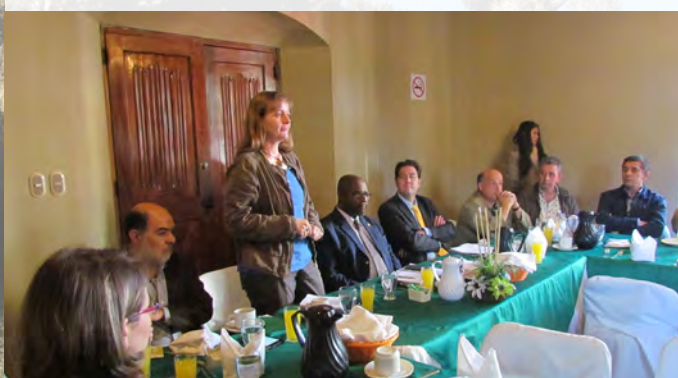
The environment minister of Guatemala, representatives of the German embassy and others participated in the official project opening in Guatemala City.

On national level, the project was presented in an official opening event as well. That way, public authorities, ministries and national institutions dealing with the management of natural resources as well as non-governmental organisations working on local development and biodiversity conservation in the three target regions could acquaint themselves with the initial situation and planned project activities. Important prerequisites for a successful implementation are good networking and a regular exchange of information on local and national level.