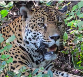
In order to conserve the biodiversity of Guatemala the rate of deforestation in the country has to decline.

Forest landscape restoration and conservation are important mainstays to protect biodiversity, the climate and, ultimately, human beings. In the last 40 years, Guatemala has lost almost half of its rainforest. This needs to stop. Only a cooperation with the local population allows for a long-term promotion of forest restoration and conservation and the concurrent establishment of alternative sources of income.