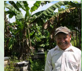
Apiculture can be integrated into agroforestry systems. The honey is harvested and processed on-site.

Besides Ramón, cacao and honey, products such as timber and cardamom could be at the centre of future value chains. These can be included into agroforestry systems as well. The more diverse a system the better crop failures, diseases and other difficulties with one plant species can be compensated by other products.