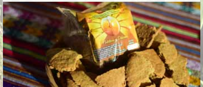
A large selection of products are available from Maya nuts (ramón) – ranging from biscuits to drinks

for women from all age groups and also for young men. Knowing the necessity of investing in developing this value chain, consulting and investment measures were carried out as part of the project. This was done to obtain the required licence and environmental tools from CONAP and the Ministry for the Environment and Natural Resources (MARN) in order to legally collect seeds on an overall area of 765 hectares of natural forest. In addition, investments were made in the infrastructure to build a seed collection centre and containers to wash the seeds (investments of around EUR 9,400 for each cooperative in 2018).