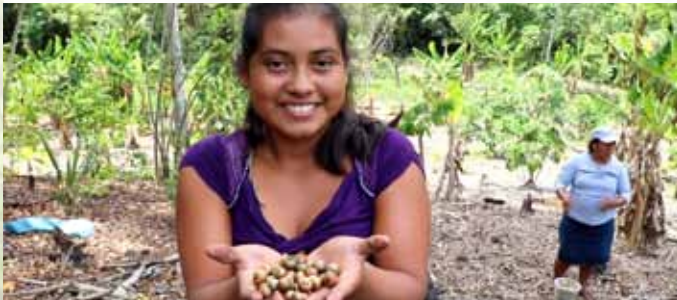
Maya nuts are gathered by hand in the periods from April to June and from September to November.

Sustainable forest management within the ForestValues project also includes the use of non-timber products. This is currently being used in the La Lucha and Unión Maya Itzá cooperatives, which are both situated in the Sierra del Lacandón National Park, to develop the Maya nut (ramón) value chain. The Maya nut is a product that has been used since the time of the Mayas in the Maya biosphere reserve. In recent years, its popularity has grown and it is being increasingly marketed. Yet, despite this fact, the process of collecting and marketing the Maya nuts in the cooperatives within the Sierra del Lacandón National Park is still in the initial stages. This is associated with the lack of infrastructure required for the production of ready-for-sale Maya nuts. At present, it is families based in rural communities getting organized to benefit from Maya nuts within the biosphere reserve's zone of use. They demonstrate how using and marketing these ramón seeds provide an opportunity for their own, sustainable activity and, in particular, for a part of the population that previously had no access to the use of natural resources.