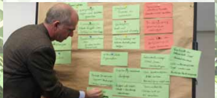
Participants closely examined the possible criteria at a workshop in Germany

Having set up both value chains and small farmer organisations, the ForestValues project is now focusing on cooperating with potential trade partners and investors from the private sector. The ForestValues team has devised a set of general criteria based on its own practical experience for cooperating with the private sector. These criteria have already been discussed with various local and international stakeholders and subsequently published in a criteria catalogue.