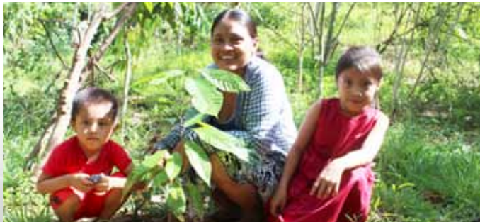
Families in the communities participating in the project already have plenty of experience in planting new trees.

Biodiverse agroforestry systems are an activity to regenerate forests, which was introduced in the form of alternative cultivation methods for cocoa, allspice and achiote cultures, since these cultures can be harvested in the medium term: harvesting achiote can be expected from the second year, while yields from allspice and cocoa can be obtained from the third to fifth year. Estimates from samples and first productions from biodiverse agroforestry systems are available for 2020 and 2021: a stable harvest is expected from 2022. A total of 450 families are participating in this activity, covering a total area of approximately 550 hectares.