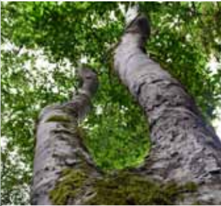
Left: The ramón tree can grow up to 30 m