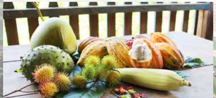
Advantages of biodiverse agroforestry system: diversification in both diet and land in the communities.

The significance of conserving biological diversity, reducing and adapting to the impacts of climate change while actively restoring ecosystems in the ForestValues project are measures that are achieved simultaneously – either in a natural way or with the help of human activities to restore the provision of original ecosystem services. Passive restoration and beekeeping activities described above enable the ForestValues project to provide ecological benefits and promote forest conservation in the core zones of the three protected areas. Active regeneration occurs by setting up biodiverse agroforestry systems and reforestation. These parallel measures contribute to mitigating the impacts of climate change by binding greenhouse gases and adapting the population to diversified and less sensitive cultures. At the same time, the project's introduction of beekeeping ensures higher protection against both fire and further destruction in the so-called "Guamiles" (secondary forests or areas that bordering onto biologically diverse agroforestry systems).