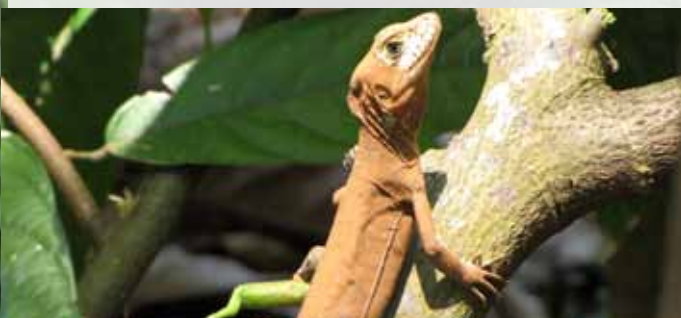
Biodiverse agroforestry systems provide habitats for many different animals.

Similarly, other cultures such as bananas, yucca, Malanga, pineapples, pigeon peas, etc. have also been introduced to improve the families' diet, generate economic income from selling surpluses, and diversify the agriculture. The ForestValues project not only contributes to landscape restoration, it also ensures sustainability from an economic point of view as follows: 1) Improved food and nutritional security with different products for short term production; 2) Economic income enabling other goods to be bought; 3) Long-term profitability, generating products for the families.