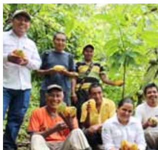
Left: Getting well organized for the harvest is important Right: Small farmers delivering and weighing their cocoa

committees and umbrella organisations with technical know-how, they are encouraged to look beyond their own immediate horizons. This is exactly where the ForestValues project currently stands. Four value chains have been established and, in addition to making processes more efficient, the main focus is on continually improving further processing and, in particular, ensuring that products are marketed in the medium to long-term. Although initial steps have been taken, the main priority is to strengthen and stabilise the organisational structures until the small farmers are able to implement the new skills themselves. Another extremely important aspect for farmers is to learn how intact eco-systems, diversification of their cultivation systems and sustainable sources of income are connected and how to write their own success stories using this model!