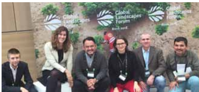
The ForestValues team, consisting of the three project partners, presented the progress in forest conservation and regeneration at the global landscape forum in Bonn.

A presentation of the ForestValues project was made to a high-level panel at the global landscape forum.