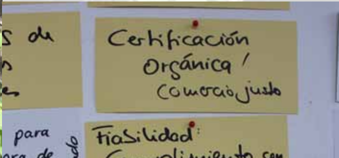
Organic certification is a recurring issue when discussing the criteria for cooperating with the private sector

The most important factor for the stakeholders on the ForestValues project, is the specific contribution that product systems make to conserving and regenerating forests in as natural a form as possible, as well as their impact on biodiversity, conservation and climate mitigation, and fair payment for small farmers.