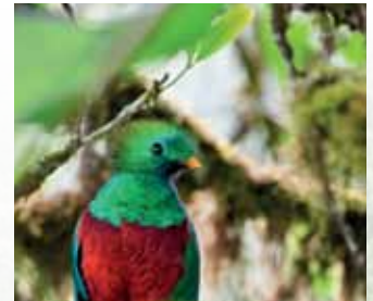
Quetzals are not the only inhabitants of the Sierra de las Minas mountain range, small farmers are also growing cocoa in the buffer zone.

The core zone of the protected area in the Sierra de las Minas is exactly what many people imagine when they think of a rainforest: giant trees covered in mist and densely overgrown with epiphytes, ferns in every imaginable form. This area is one of the last places to serve as a refuge for the quetzal, the national bird of Guatemala. Indigenous communities cooperating on the project reside in the buffer zone around the strictly protected core zone of the conservation area. Many of the small farmers and their families involved in the project are particularly interested in growing cocoa and beekeeping as alternative sources of income. They benefit from the fact that the mountain cloud forest is the source of many streams and rivers.