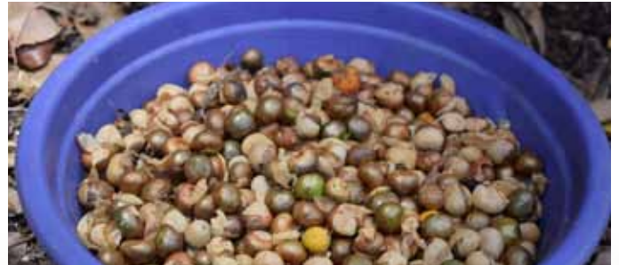
Collecting is only the first step: processing the Maya nuts is important for food production

This activity has little impact on the natural environment and is relatively easy to carry out, as the nuts are collected from fallen seeds in the forest without damaging the trees in any way. Collecting the seeds is particularly attractive