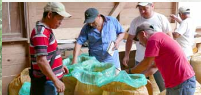
Cocoa sales were a success for the small farmers. The buyer was extremely satisfied with the quality of the cocoa.

The result: With advance financing for the harvest, a total of 17,550 kg fresh cocoa beans from 379 small farmers from 14 communities in the Sierra de las Minas and Bocas del Polochic project areas were bought and processed into 5,890 kg fermented and dried raw cocoa beans. Almost the entire production has already been sold to various buyers in Guatemala at good prices. Since the interim income from the sales has been reinvested in purchasing more freshly harvested cocoa beans, the 6,000 euros from the revolving fund has made a total of around 14,000 euros of direct crop income possible for cocoa farmers! In addition, wage payments for processing the cocoa has provided extra income in local communities. A resounding success for the ForestValues project.