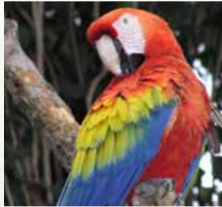
Right: The scarlet macaw – a symbol of Sierra del Lacandón

The Sierra del Lacandón National Park on the border to Mexico is characterised by its limestone soil and abundant biodiversity. It is home to the scarlet macaw, as well as to jaguars, tapirs and many others. Its lowland rainforest has many ramón trees (their fruit is known as the Maya nut). The ancient Mayans benefited from this tree species as do the communities participating in the project today. Some of project participants are involved in processing ramón seeds (Maya nuts), which are rich in nutrients, while others are also involved in beekeeping.