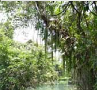
An abundance of biodiversity can be discovered around Lake Izabal – up to where the monoculture of the oil palm plantation begins