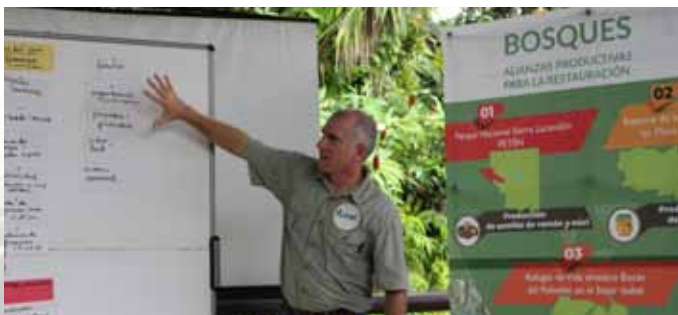
A range of criteria was discussed at the ForestValues workshop with the entire project team.

The aim of the ForestValues project is to develop business models for cooperating with the private sector that can be used for the socially compatible restoration of natural forests. The business models are based on local value chains with cocoa, honey and Maya nuts. In order to be successful in the long-term when cooperating in such trade partnerships or making investments, it is necessary for both parties to meet a large number of requirements and criteria.